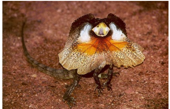
When a predator is near, the frilled lizard stands on its back legs and opens its mouth and frill to look bigger.

The running pattern of the frilled lizard is also pretty interesting to watch. When you run, you put one foot in front of the other, but the frilled lizard keeps its four legs out and spins, like when you pedal a bicycle. It can even run on just its two back legs.