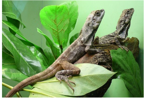
The frilled lizard grows up to 3ft. long.

The frilled lizard is a reptile from Australia and Papua New Guinea. It spends most of its time in trees and has excellent camouflage . It eats insects, spiders, and small animals with its chisel teeth . When scared by predators, it opens its large frill, hisses, and runs away if needed. Baby frilled lizards are independent from the first day they hatch.